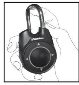
4. Pull up on the shackle to open the lock.